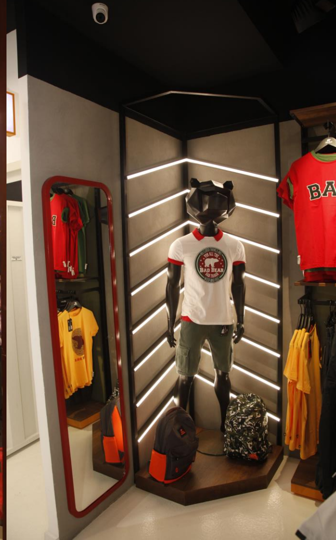
... and now with its own stores!